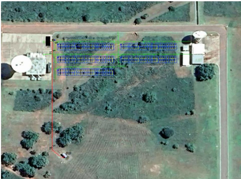
Figure 3: Hybrid 150kWp PV system

The PV arrays shall provide an approximate total output of 200kWp and be a PV hybrid system with battery backup, associated communication and display elements.