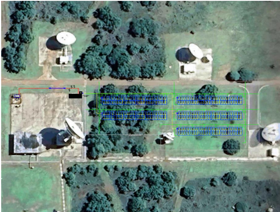
Figure 1: Hybrid 150kWp PV system

The PV arrays shall provide an approximate total output of 150kWp and be a PV hybrid system with battery backup, associated communication and display elements.