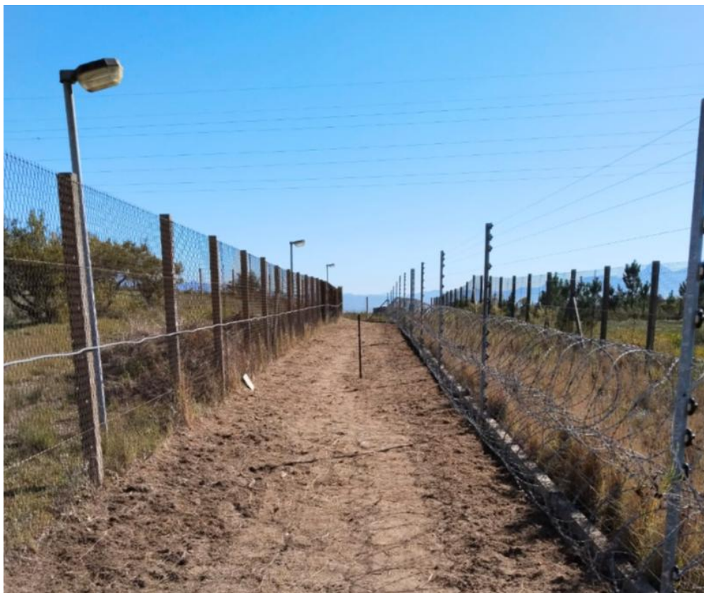
Figure 1: Perimeter fence at Houwteq

The purpose of this RFI is to establish and/or obtain information on the scope of work for cost estimation of the rectification/repairs of the electric fence in order to be operational again.