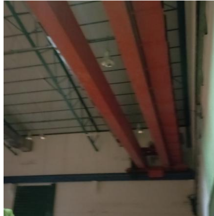
5ton Crane (Bay 1)