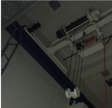
Preparation Area (5T)