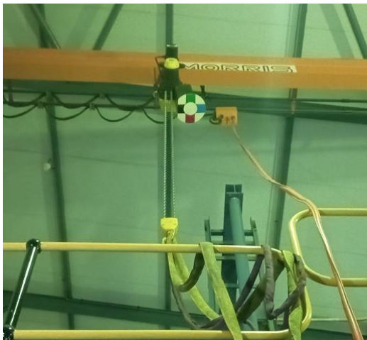
Back room (2Ton)