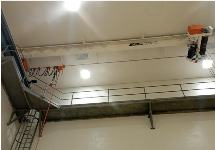
Radiometric Lab (5Ton)