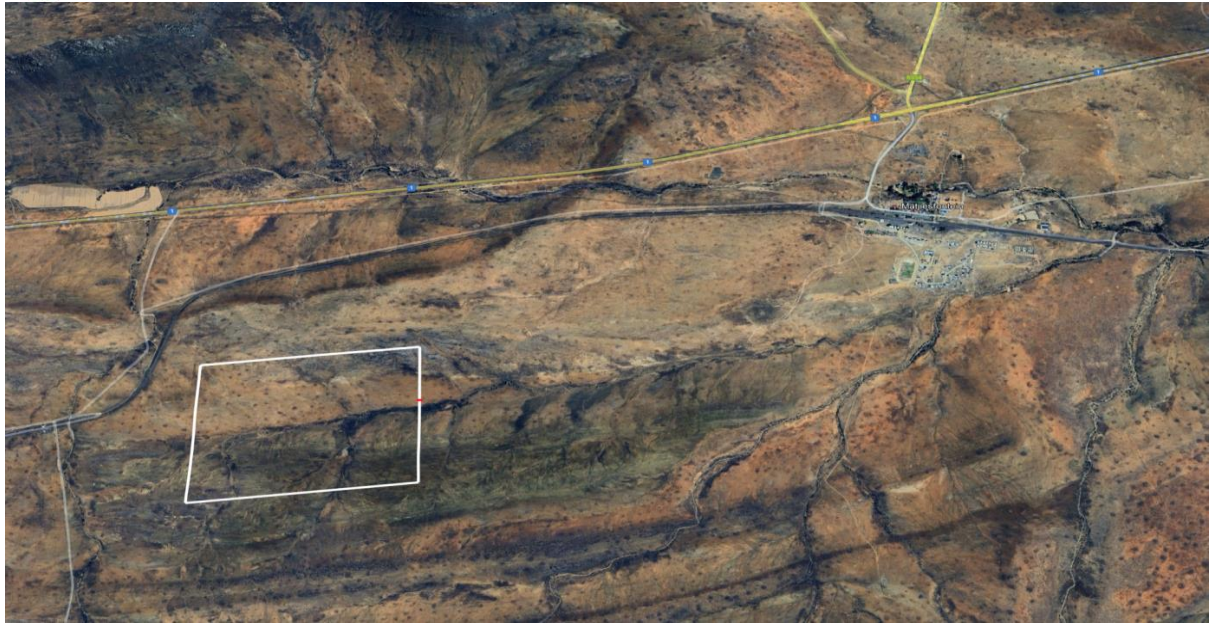
Figure 1 The Proposed site and Matjiesfontein Town, Western Cape