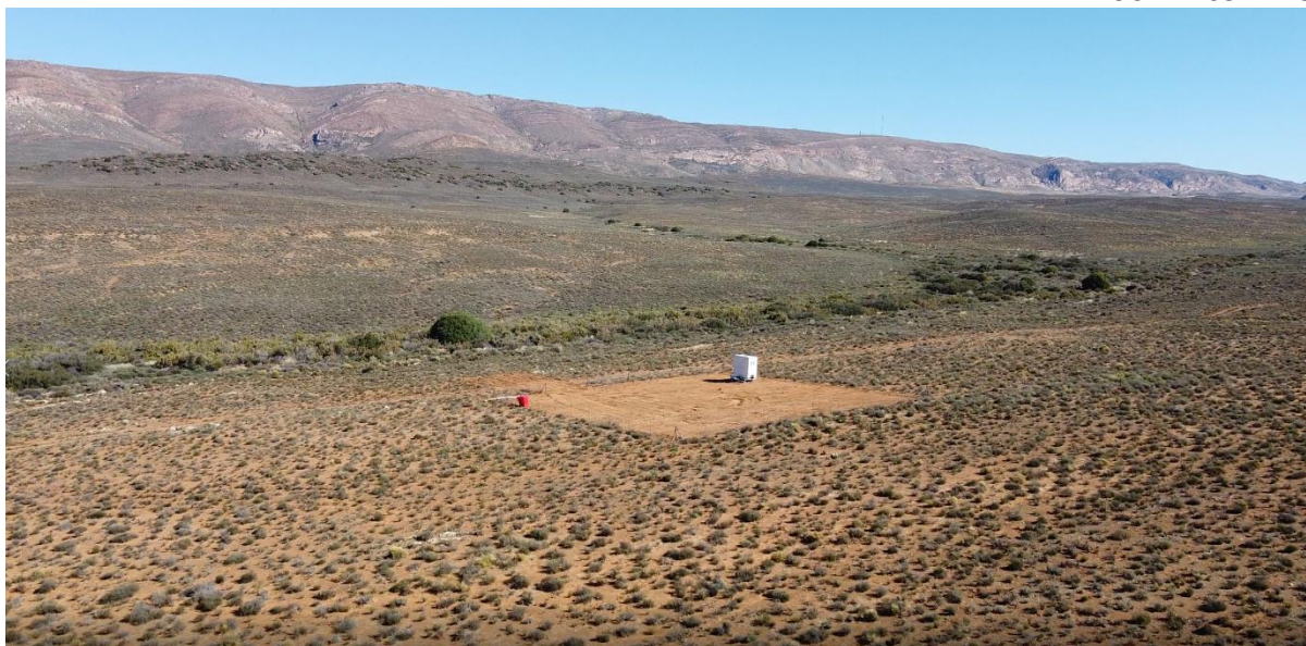
Figure 2: MTJ Landscape