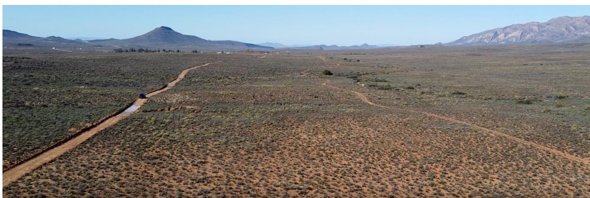
Figure 3: MTJ Landscape