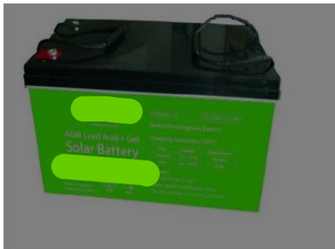
Image is for illustration purposes as any similar unit maybe provided