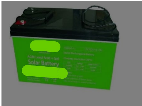
Image is for illustration purposes as any similar unit maybe provided