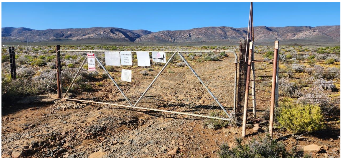
Figure 3: Existing outer perimeter gate to be replaced.