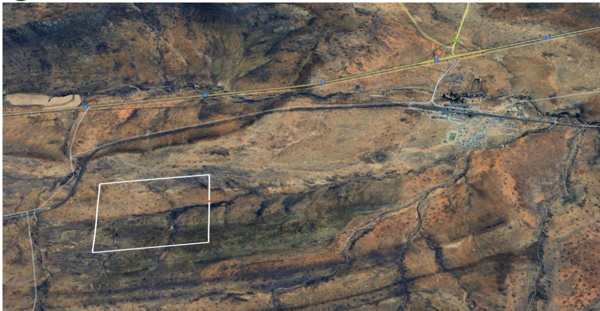
Figure 1 The Proposed Fence and Matjiesfontein Town, Western Cape