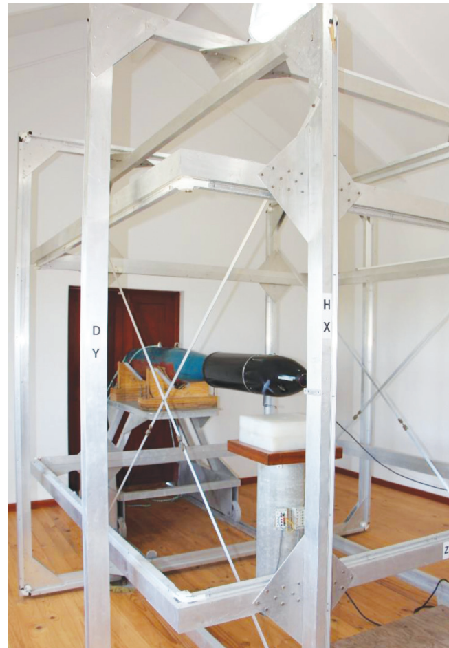
Figure 1: SANSA operates the only large tri-axial Helmholtz Coil system in Africa. The system can create or cancel any geomagnetic field and is used to evaluate and calibrate various magnetic sensors and magnetic systems prior to being integrated onto dynamic platforms such as satellites and UAVs.

The Earth’s magnetic field is a key factor for accurate navigation and long-range weapons delivery, and is a dynamic, changing phenomenon. This means that there is a requirement for annual updates of magnetic inclination and declination to enable charts and maps to be updated. Magnetism is also relevant in other respects, the most obvious being the integration and calibration of magnetic compasses and other equipment with dynamic platforms such as aircraft, unmanned aerial vehicles (UAVs), ships or combat vehicles 1 .