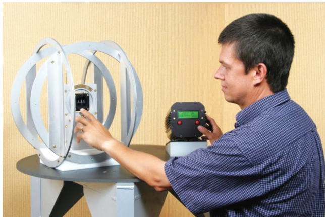
Figure 2: SANSA developed and designed a Magnetic Test Bench which is used for verification of standby (emergency) compasses prior to installation aboard aircraft. The system won several local and international design awards and is used extensively by the SA Air Force.

SANSA's facilities in Hermanus are located within a well preserved magnetically clean environment, making the facility well suited for characterising and calibrating magnetic sensors, as well as identifying the magnetic signature of dynamic platforms prior to sensor integration. There is no other such facility on the African continent. The applications made possible through this facility are due to the unique location and the development and preservation of this magnetically clean area. Therefore, it is necessary to create an understanding and awareness of the importance of the magnetically clean area to the nation, particularly with respect to safety and security. SANSA's space related expertise and facilities are also valuable to many non-space applications. This policy brief aims to put forward recommendations to assist decision-makers in understanding the importance of these unique facilities to many sectors in South Africa, and in particular with regards to safety and security.