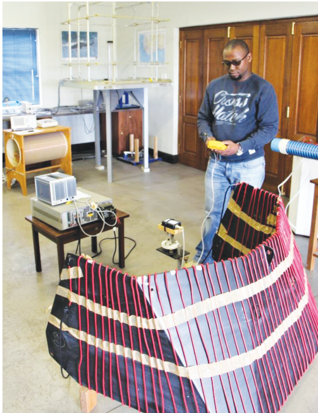
Figure 5: The development of a maritime solution for vessel protection is just one of the examples of how a magnetically clean environment can benefit both the space and non-space sectors.

products and services to the space and non-space sectors. The legacy of an 80 year old facility also provides a certain level of recognition and assurance of quality that is required for the safety of life operations that a magnetically clean environment contributes to. There is, therefore, a requirement for South Africa to preserve such an environment and the facility that provides the underlying expertise needed to operate and maintain this infrastructure.