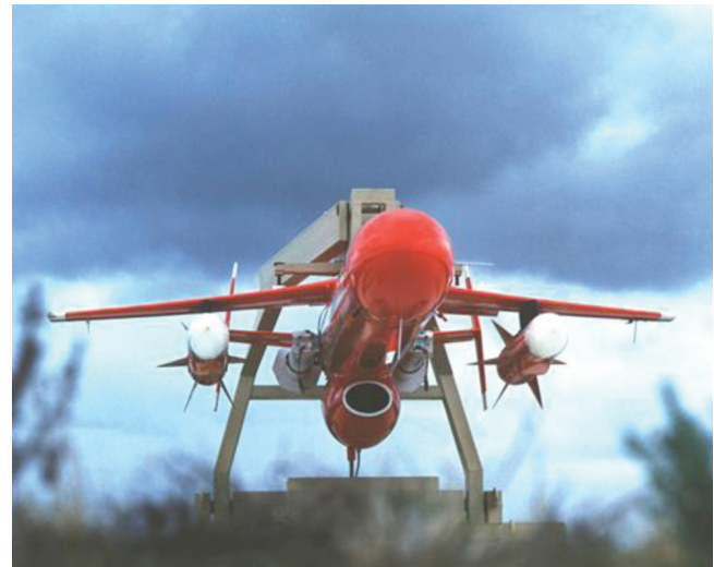
Figure 3: SANSA is the only facility in Africa which is able to calibrate magnetic sensors prior to integration onboard dynamic platforms such as UAV's and satellites.

The measurements of the Earth's magnetic field can only be obtained from instruments that are operated within a magnetically clean environment. Therefore, the provision of space weather information to various sectors including but not limited to defence, aviation, maritime, and energy, can only be undertaken with access to a local magnetic data source.