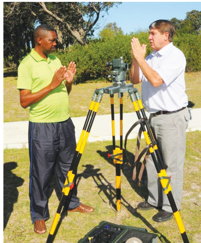
Figure 4: SANSA provides specialised training courses in magnetic awareness and compass swing procedure to the defence, maritime and aviation sector.

The magnetically clean facilities combined with the unique geomagnetic expertise and knowledge is a formidable combination that can be utilised to solve a number of challenges within the safety and security domain in South Africa and the rest of Africa.