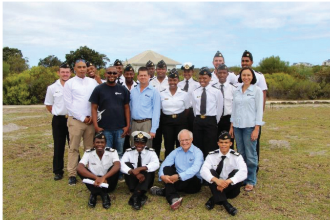
Figure 6: SANSA training courses are hosted within the magnetically clean facility in Hermanus which allows participants to actively engage with the facility and expertise available.

South Africa over the past 80 years. This contribution comes from the foundation of a magnetically clean environment which should be recognised as a national asset which requires continued protection.