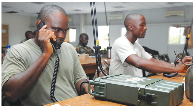
Figure 3: HF radio and satellite communications can be severely affected by space weather; resulting in communication blackouts.

The security sector can be significantly affected by adverse space weather, with the extent of the risk dependent on the systems in use. Key elements of any military operation are being able to navigate and communicate effectively. The former requires magnetic compasses and GPS systems while the latter requires effective radio and satellite communications which can be affected by space weather. While there are no economic studies concluded in this area, it is possible to reason that a complete communications blackout, which is entirely possible as a consequence of a space weather storm, could be a critical safety of life concern. The military are heavily dependent on HF communications, and could be rendered inoperable for days as a result of a space weather storm. The downstream consequence of this could be isolated troops, delayed campaigns and exercises, and the lack of a backup in the event of a disaster. It is not possible to put a cost to the loss to military operations, and the risk to lives.