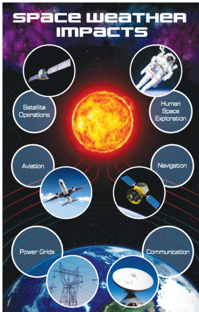
Figure 1: Space weather can disrupt modern technologies such as GPS, power grids, avionics, navigation and communication systems.

Space weather refers to the conditions in space; on the Sun and in the solar wind, magnetosphere, ionosphere, and thermosphere that can influence the performance and reliability of space-borne and ground-based technological systems. Space weather is a consequence of the behaviour of the Sun, the nature of Earth's magnetic field and atmosphere, and the Earth's location in the solar system.