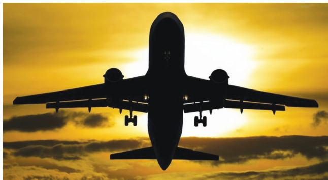
Figure 4: Space weather could potentially create huge disturbances in the transport, aviation and navigation sectors.

The impact of space weather storms on the transportation sector has been considered with respect to aviation, rail, and maritime. Within aviation the impact from a space weather storm could result in the re-routing or grounding of flights, damage to avionics systems, the unavailability of communication systems, inaccuracies introduced in navigational aids, and degradation in the accuracy of landing systems. In extreme cases, airports and other transportation hubs may need to be closed for extended periods of time causing huge inconveniences and economic implications for passengers and airline companies 6,14 .