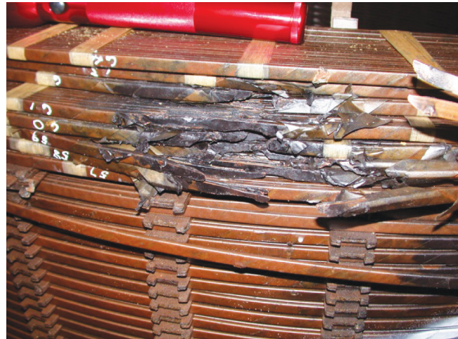
Figure 2: Damage to a large power transformer in South Africa due to the effects of a space weather storm which gave rise to GICs.

Calculating the exact loss that could incur as a result of GICs is a challenging task, as the damage is not always instantaneous and the impact is far reaching given the nation's dependence on reliable electrical power. The calculation for the economic impact resulting from GICs needs to include a loss of income to the power utility, the cost of replacing damaged transformers, the cost of generating electricity through other means, and the loss of income from mines and other revenue generating industries. The downstream impact to the health, aviation, education, financial and security sectors is also significant and would need to be factored in.