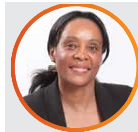
Mbali Mfeka Usihlalo: Ucwaningomabhuku Nobungozi