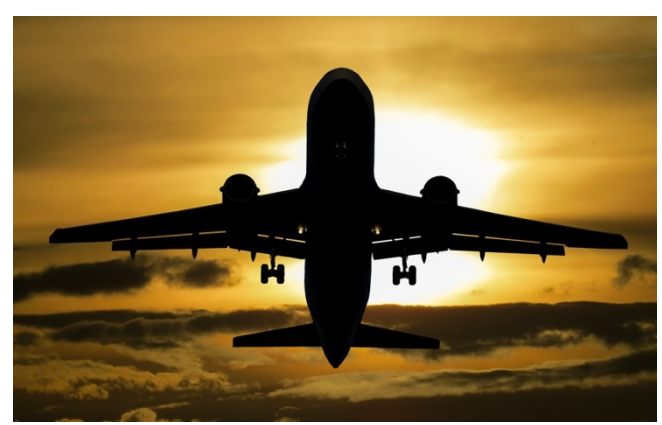
Figure 4: Space weather could potentially create huge disturbances in the transport, aviation and navigation sectors.

The impact of space weather storms on the transportation sector has been considered with respect to aviation, rail, and maritime. Within aviation the impact from a space weather storm could result in the re-routing or grounding of flights, damage to avionic systems, the unavailability of communication systems, inaccuracies introduced in navigational aids, and degradation in the accuracy of landing systems. In extreme cases, airports and other transportation hubs may need to be closed for extended periods of time causing huge inconveniences and economic implications for passengers and airline companies<sup>6,14</sup>.