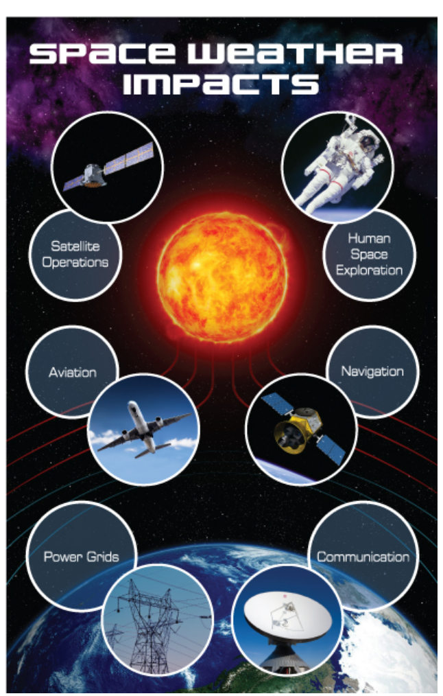
Figure 1: Space weather can disrupt modern technologies such as GPS, power grids, avionics, navigation and communication systems.

Space weather refers to the conditions in space; on the Sun and in the solar wind, magnetosphere, ionosphere, and thermosphere that can influence the performance and reliability of space-borne and ground-based technological systems. Space weather is a consequence of the behaviour of the Sun, the nature of Earth's magnetic field and atmosphere, and the Earth's location in the solar system. The Sun is the driver of space weather, therefore, monitoring solar events is a key component in providing a space weather forecasting and prediction service.