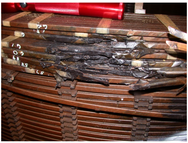
Figure 2: Damage to a large power transformer in South Africa due to the effects of a space weather storm which gave rise to GICs.

education, financial and security sectors is also significant and would need to be factored in.