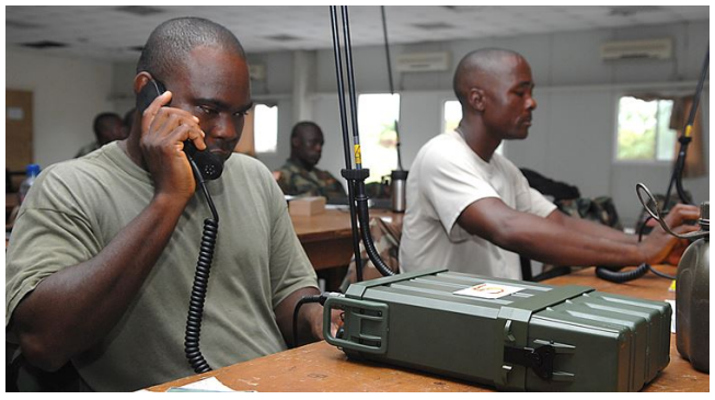
Figure 3: HF radio and satellite communications can be severely affected by space weather; resulting in communication blackouts.

The security sector can be significantly affected by adverse space weather, with the extent of the risk dependent on the systems in use. Key elements of any military operation are being able to navigate and communicate effectively. The former requires magnetic compasses and GPS systems while the latter requires effective radio and satellite communications which can be affected by space weather. While there are no economic studies concluded in this area, it is possible to reason that a complete communications blackout, which is entirely possible as a consequence of a space weather storm, could be a critical safety of life concern. The military are heavily dependent on HF communications, and could be rendered inoperable for days as a result of a space weather storm. The downstream consequence of this could be isolated troops, delayed campaigns and exercises, and the lack of a backup in the event of a disaster. It is not possible to put a cost to the loss to military operations, and the risk to lives.