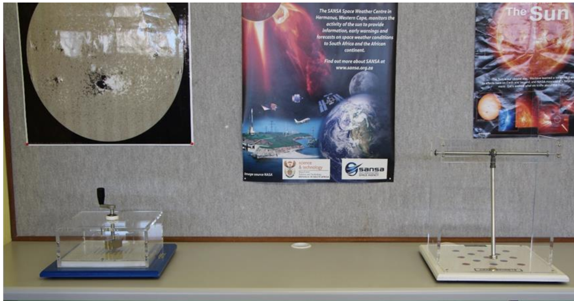
Exhibit 5: Satellite Model