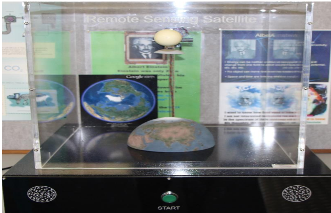
Exhibit 3: Global Positioning System Demonstrator