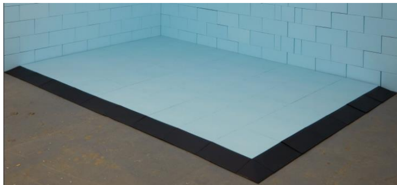
Figure 5a: Exhibit floors