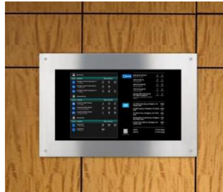
Figure 2b: Large screen embedded in the support structure