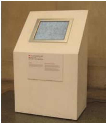
Figure 3a: Multi-media touch screen embedded in the support structure at a museum