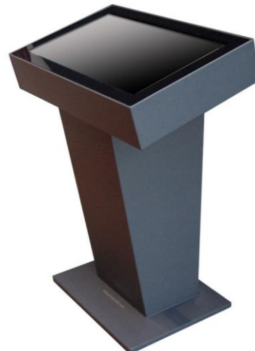
Figure 3b: Multi-media touch screen kiosk