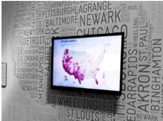
Figure 2a: Large screen mounted onto a non-permanent wall at an exhibition