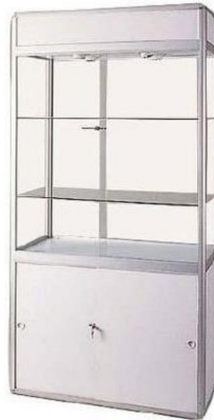
Figure 4b: Example of lockable glass display cabinets with lockable cupboards underneath