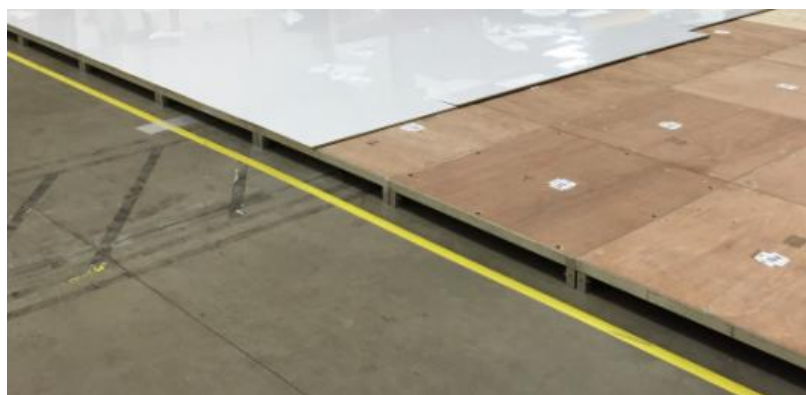
Figure 5b: Exhibit floors slightly raised