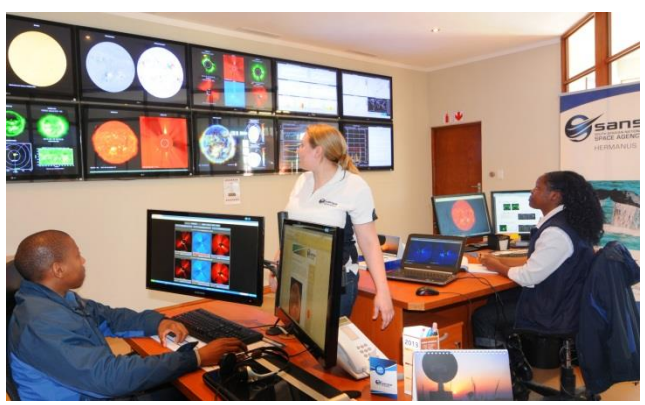
Figure 4: The SANSA Space Weather Centre provides valuable data, information and interpretation on the impacts of space weather.

the understanding and awareness of space weather within Africa, and (iii) provide a space weather operational service to government and industry users.