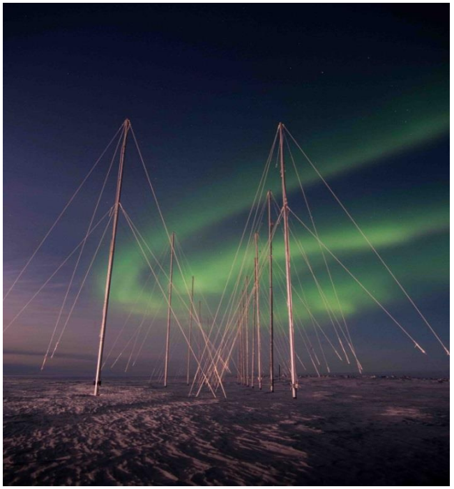
Figure 5: SANSA operates a wide suite of space monitoring instrumentation which provides valuable space weather data to scientists and forecasters on the state of the space environment.

Through the International Space Environment Service (ISES) and the South African Weather Service (SAWS), SANSA is representing South Africa on a number of expert groups that are developing the provisions required to meet this recommendation. It has been recommended that nations be ready to integrate space weather into the aviation sector by 2017.